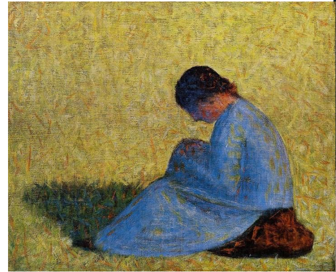
By: George Seurat