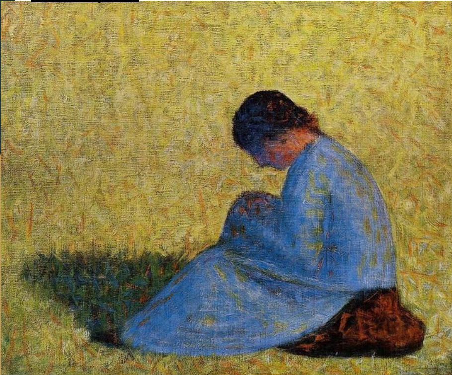
By: George Seurat