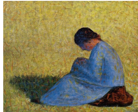
By: George Seurat