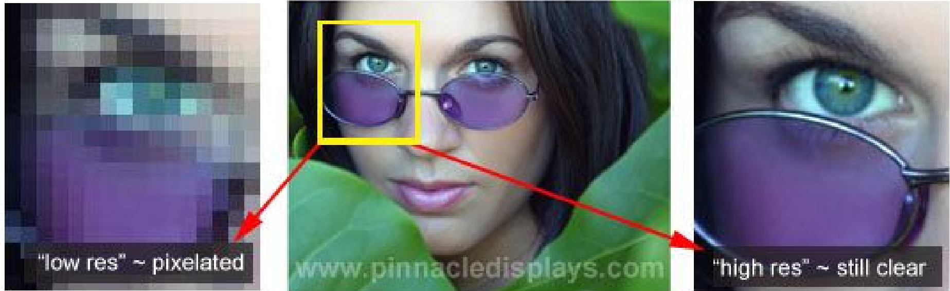
IMAGE RESOLUTION ("dpi"): A "low resolution" image will look "pixelated" when it is scaled up for printing. A "high resolution" image will still be clear when scaled up.

You can check and estimate your image quality by zooming in on it.