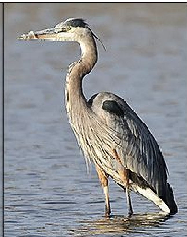
High Contrast / High Resolution