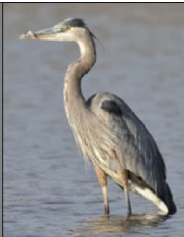
High Contrast / Low Resolution