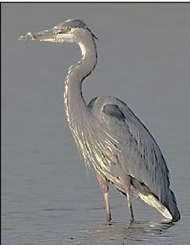
Low Contrast / High Resolution